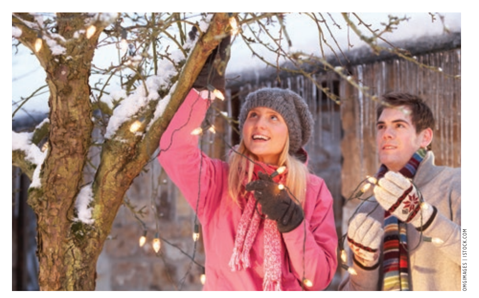
Keep lights and ladders clear of power lines when decorating outside.